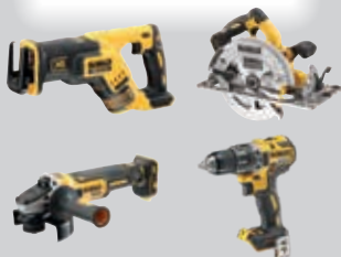
SELECTED PRODUCTS FROM 18V XR ASSORTMENT