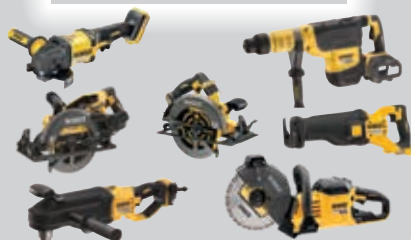
SELECTED PRODUCTS FROM 54V XR ASSORTMENT