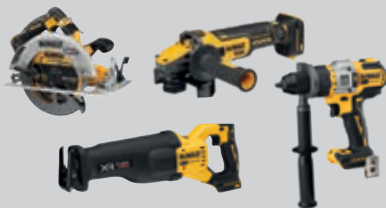
CURRENT 18V FLEXVOLT ADVANTAGE ASSORTMENT