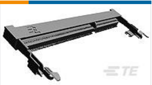
TE Part #2-2013297-1 EMBOSS TAPE DDR3 204P 8H STD