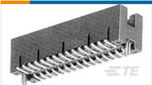
TE Part #5-104655-1 10 50/50 HDR DRST SFMNT TIN