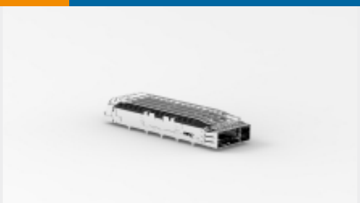
TE Part #4-2170705-4 CAGE ASSY, QSFP28 1X1, SPRING, HS, LP