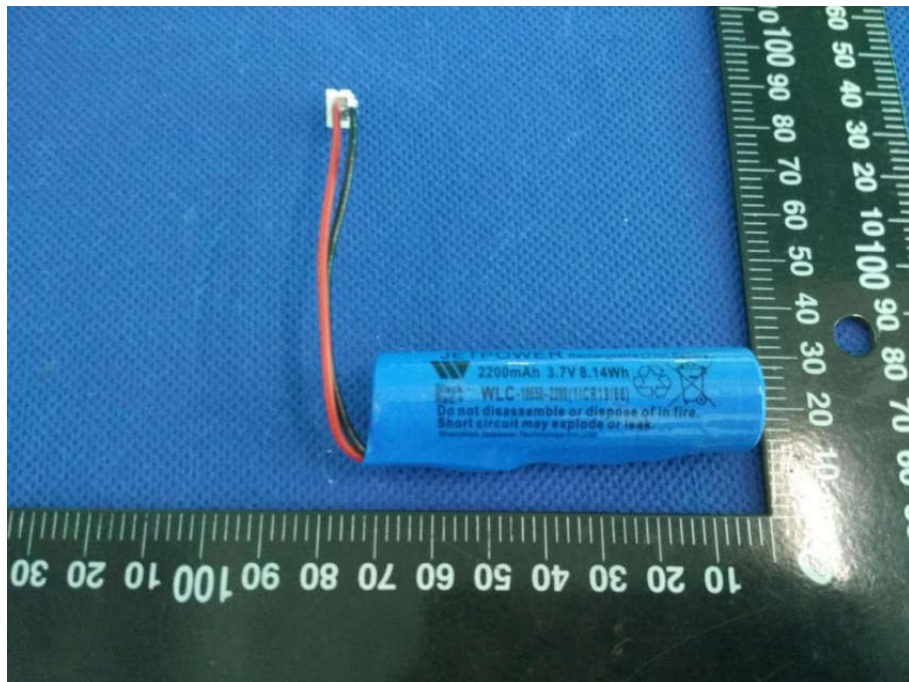
电池组外观 View Of The Battery