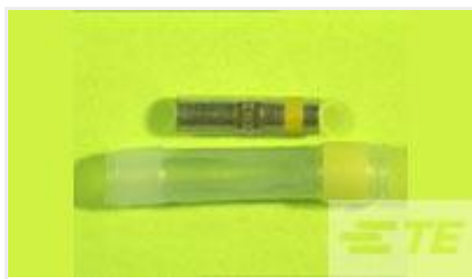
TE Part #650128-000 D-436-84