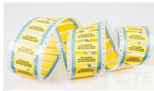
TE Part #5414710001 TMS-SCE-1-1/2-2.0-9