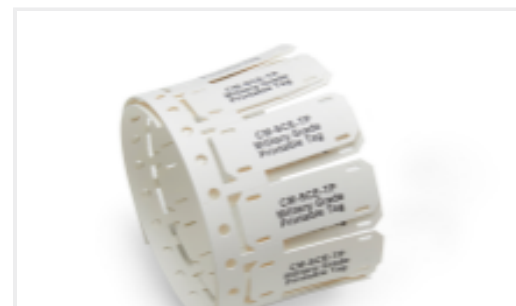
TE Part #CAT-T3437-C6298 CM-SCE-TP Military Grade Markers