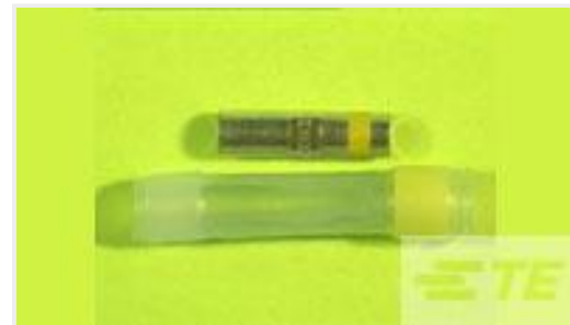
TE Part #650127-000 D-436-83