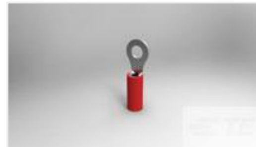
TE Part #36149 PIDG R 22-16 COMM 22-18 MIL 6