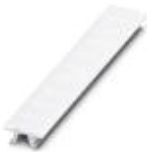
Zack marker strip, Can be ordered: Strip, white, Labeled according to customer specifications, Mounting type: Snap into tall marker groove, For terminal block width: 6.2 mm, Lettering field: 6.15 x 10.5 mm

Marker for terminal blocks - UC-TM 6 CUS - 0824589