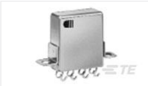
TE Part #3-1617019-7 FW1120G01 = M5757/10-039