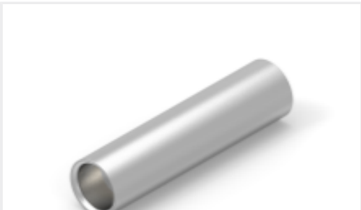
TE Part #CAT-C7901-AL82 COPALUM Sealed: Butt Splices