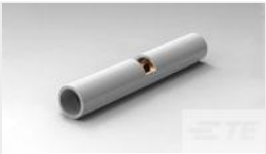
TE Part #2-323975-3 SPLICE, BUTT, PIDG, 24-20, T&R