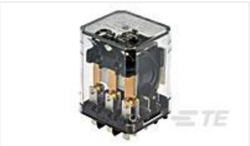
TE Part #1393118-2 KUP-14A55-24=KU