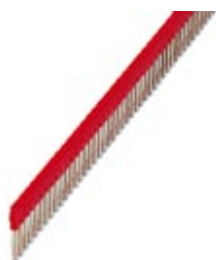
Plug-in bridge, Number of positions: 50, Color: red

Please be informed that the data shown in this PDF Document is generated from our Online Catalog. Please find the complete data in the user's documentation. Our General Terms of Use for Downloads are valid ( http://download.phoenixcontact.com )