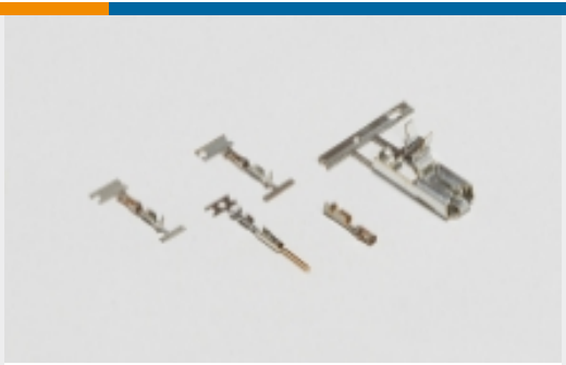
Wire-to-Board Connector Contacts(2)