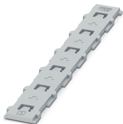
ME-IO Blockbelt, for 6 PCB connectors, color: light gray (7035)

Please be informed that the data shown in this PDF Document is generated from our Online Catalog. Please find the complete data in the user's documentation. Our General Terms of Use for Downloads are valid ( http://phoenixcontact.com/download )