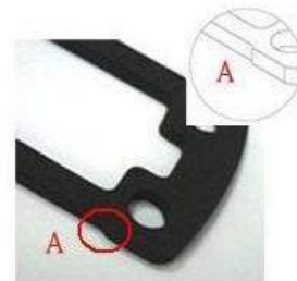
1.Pay attention on the seal (position A).