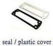
seal / plastic cover