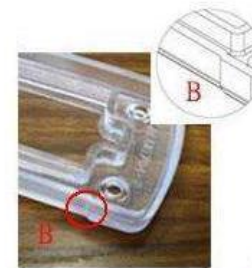
2.Pay attention on the cover (position B).