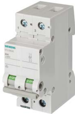
off switch 80A 2-pole