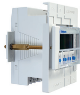
Front panel mounting kit ↳ Art.No.: 9070001

Light sensors Wall mounting kit Front panel kit