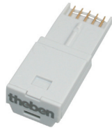
OBELISK top2 memory card ↳ Art.No.: 9070404