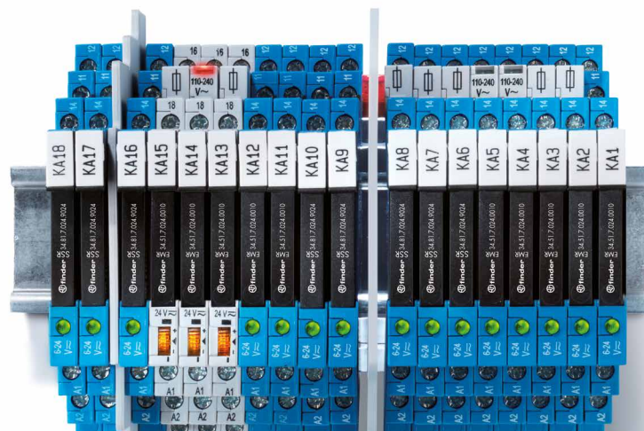
With socket - 35 mm rail mounted