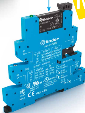
New product EMR