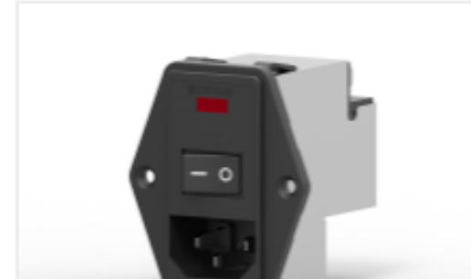
TE Part #2-6609104-0 PE0SXDS6B=C1228