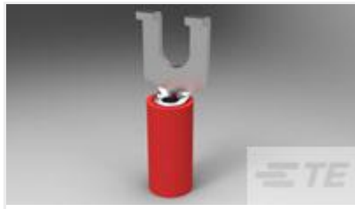
TE Part #32562 PIDG SPDFLG 22-16COMM22-18MIL6