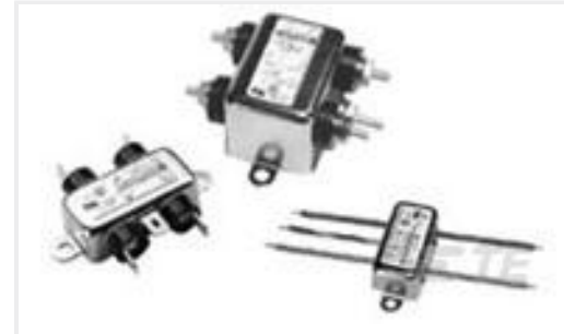
TE Part #1-6609021-1 20VB1=F7130 S0