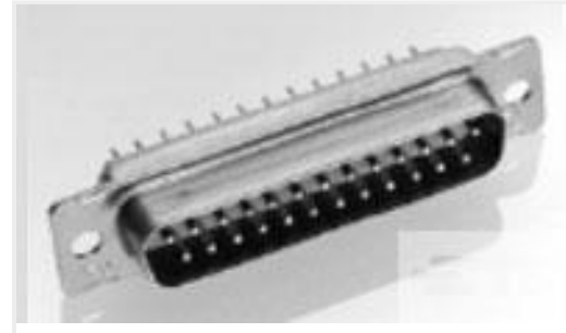
TE Part #1757819-2 AMPLIMITE,ASY,PLUG,STD,109,ZN,2