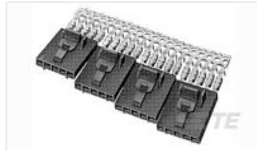
TE Part #5-103957-7 2X8 MTE RCPT SR LATCH .100CL