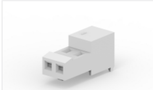
TE Part #CAT-104MTA-NTPNR MTA Receptacle: Nylon, Tin Plated, 2.54 mm