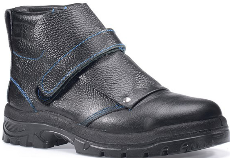
Dual Density Rubber sole