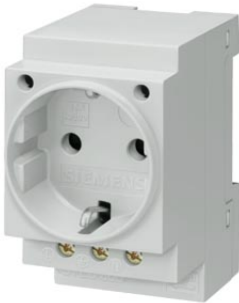
SCHUKO SOCKET 16A ACCORDING TO DIN VDE 0620 FOR INSTALL. IN DISTRIBUTION BOARDS