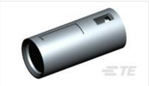
TE Part #293359-1 NECTOR S TUBE FOR SVT CABLE