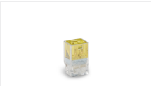
TE Part #CS6084-000 CPGI-WC-PG-2-PORT-BULK