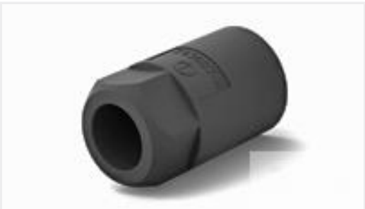
TE Part #1-293607-1 NECTOR M CABLE NUT DIA 7.5-8.4 MM