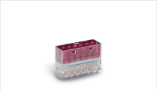
TE Part #CS6085-000 CPGI-WC-PG-6-PORT-BULK