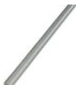
Continuous plug-in bridge, length: 500 mm, color: gray

Continuous plug-in bridge - FBST 500-PLC GY - 2966838