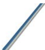
Continuous plug-in bridge, length: 500 mm, color: blue

Continuous plug-in bridge - FBST 500-PLC BU - 2966692