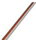
Continuous plug-in bridge, length: 500 mm, color: red

Continuous plug-in bridge - FBST 500-PLC RD - 2966786