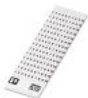
Marker card, Card, white, labeled, Horizontal: Consecutive numbers 1 - 10, 11 - 20, etc. up to 91 - 99, Mounting type: Adhesive, for terminal block width: 2.54 mm, Lettering field: 2.54 x 2.8 mm

Marker card - SK 2,54/2,8:FORTL.ZAHLEN - 0804853