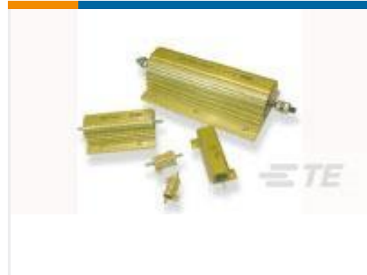
TE Part #2-1625999-3 HSC100 2K0 5%