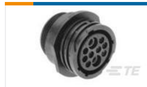
TE Part #213893-1 CPC RCPT,FLNGE MNT, SRS 6,17-10