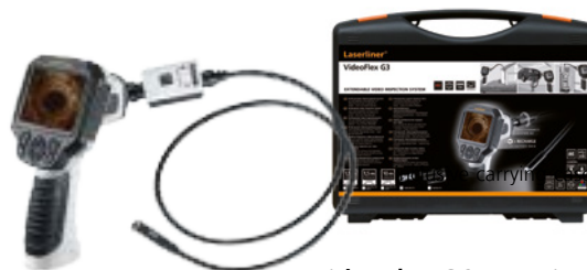
VideoFlex G3 DuoView