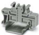
Quick mounting end clamp for NS 35/7,5 DIN rail or NS 35/15 DIN rail, with marking option, width: 9.5 mm, color: gray