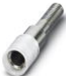
Female test connector, Color: transparent

Female test connector - PSBJ 4/15/6 FARBLOS - 0303419