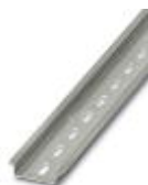
DIN rail, material: steel galvanized and passivated with a thick layer, perforated, height 7.5 mm, width 35 mm, length: 2000 mm

DIN rail perforated - NS 35/ 7,5 PERF 2000MM - 0801733