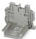
Quick mounting end clamp for NS 35/7,5 DIN rail or NS 35/15 DIN rail, with marking option, with parking option for FBS...5, FBS...6, KSS 5, KSS 6, width: 5.15 mm, color: gray