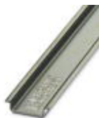
DIN rail, material: Steel, unperforated, height 7.5 mm, width 35 mm, length: 2 m

DIN rail, unperforated - NS 35/ 7,5 UNPERF 2000MM - 0801681