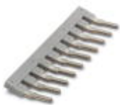
Insertion bridge, Number of positions: 10, Color: gray