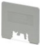
Partition plate, Length: 80 mm, Width: 2 mm, Height: 70 mm, Color: gray

Separating plate - TS-USST 4/10 - 3070383