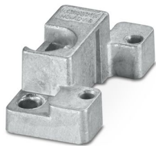
Panel mounting flange for HEAVYCON ADVANCE TMB housing with bayonet locking

Please be informed that the data shown in this PDF document is generated from our online catalog. Please find the complete data in the user documentation. Our general terms of use for downloads are valid.