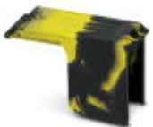
Covering hood, Connection method: Bolt connection, Width: 29 mm, Height: 33 mm, Color: black/yellow