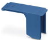
Covering hood, Connection method: Bolt connection, Width: 29 mm, Height: 33 mm, Color: blue