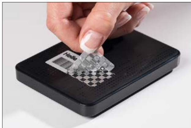
Highly visible tamper evidence.