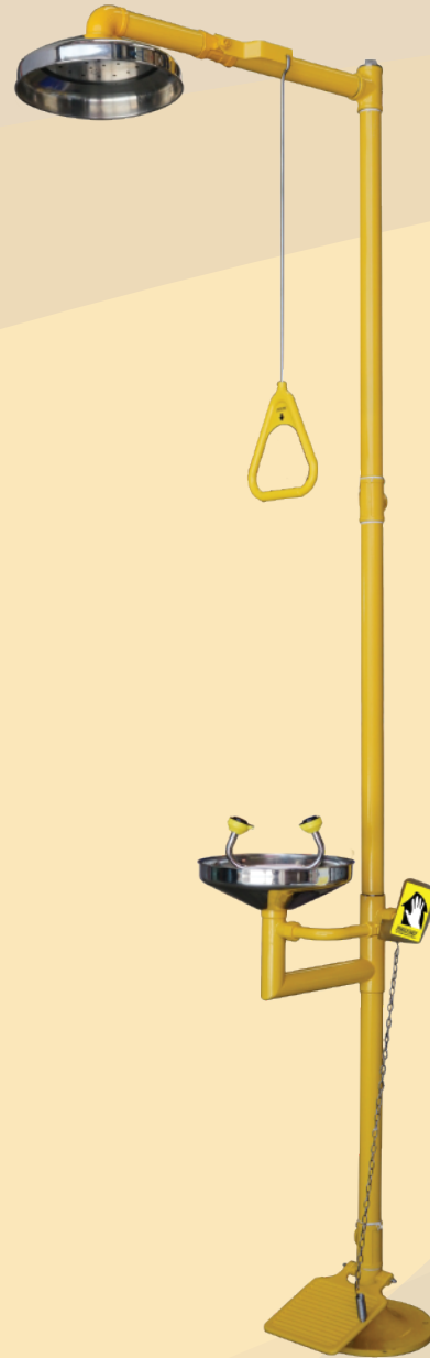
PG 10022 SS