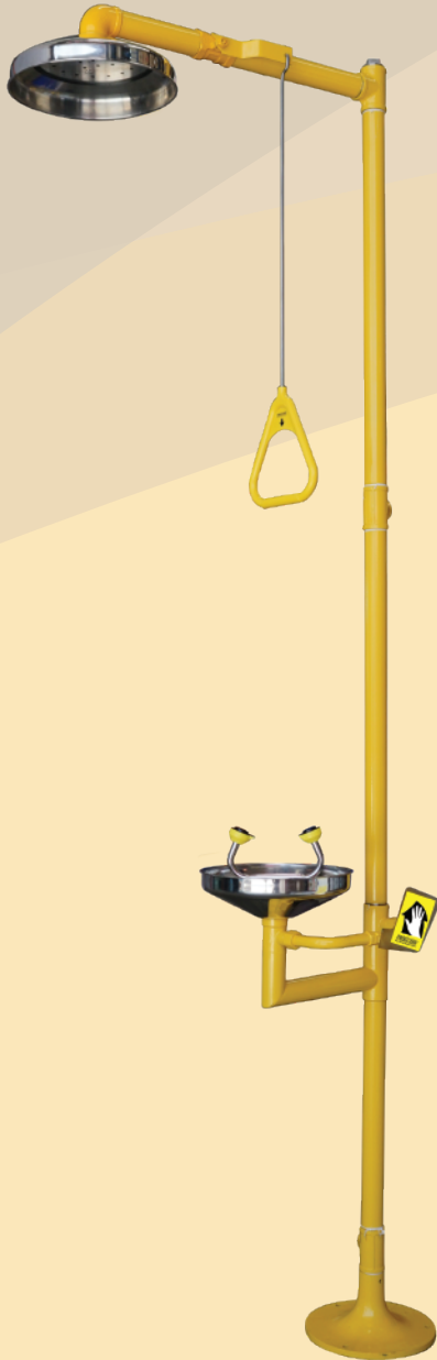
PG 10020 SS