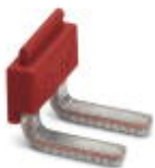
Insertion bridge, Number of positions: 2, Color: red

Insertion bridge - EB 2- DIK RD - 2716693