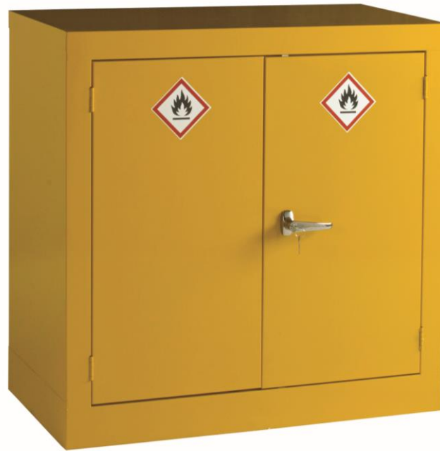
Cabinet Size: H915 x W915 x D459mm