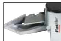
BLADE ELEVATES UPON OPENING FOR QUICK ACCESS.