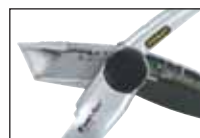
SWIVELS OPEN FOR QUICK BLADE CHANGE, NO TOOLS REQUIRED.