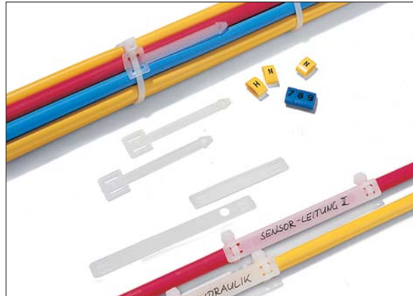
A clearly better way of identifying cables and pipes.

Used with Ovalgrip markers for identifying larger pipes and cables.