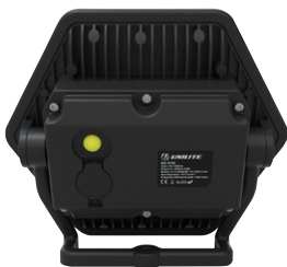
USB POWER BANK FACILITY