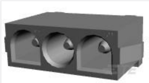
TE Part #350429-1 03P UMNL PIN HDR ASSY NATL