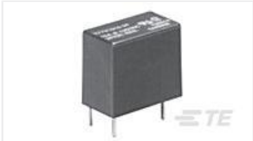
TE Part #1-1393194-9 T77V1D10-12