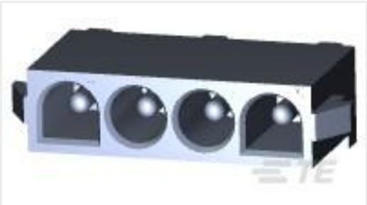
TE Part #194010-1 PIN ASSY..070