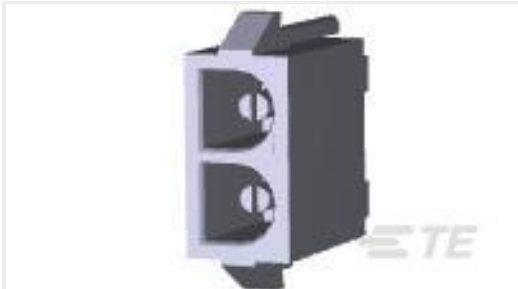
TE Part #641963-1 02P UMNL PIN HDR ASSY POL NATL