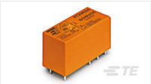
TE Part #6-1393243-8 RT424024