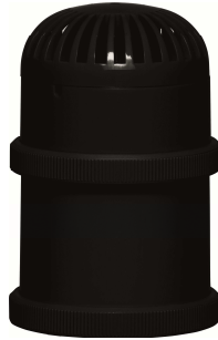
Acoustic warning device