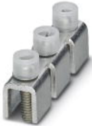
Fixed bridge, Number of positions: 3, Color: silver

Please be informed that the data shown in this PDF Document is generated from our Online Catalog. Please find the complete data in the user's documentation. Our General Terms of Use for Downloads are valid ( http://phoenixcontact.com/download )