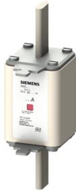
LV HRC fuse element, NH2, In: 224 A, gG, Un AC: 500 V, Un DC: 440 V, Combined indicator, live grip lugs