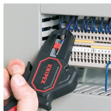
Stripping in confined areas