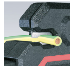
Precise stripping from 0.2 up to 6.0 mm 2