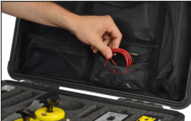
Figure 3. Using the ESD Survey Kit's lid organiser

The ESD Standard EN 61340-5-1 can be purchased from www.bsigroup.com .