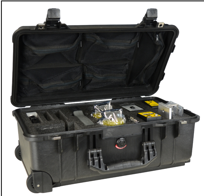
Figure 1. Desco Europe 222688 ESD Survey Kit