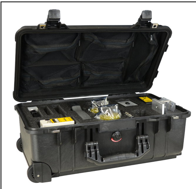
Figure 2. Desco Europe 222688 ESD Survey Kit