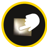
LUXURIOUS SOFT TOUCH FLEECE INNER