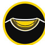
HALF MOON YOKE