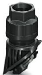
EVO plastic cable gland with bayonet locking, for housing series B, size M32, cable diameter: 11 ... 21 mm

Please be informed that the data shown in this PDF Document is generated from our Online Catalog. Please find the complete data in the user's documentation. Our General Terms of Use for Downloads are valid ( http://phoenixcontact.com/download )