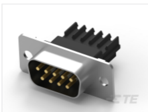
TE Part # CAT-AM7-248H3 IDC D-Sub: Plug Assembly, Wire to Wire, Signal, 2.77 mm