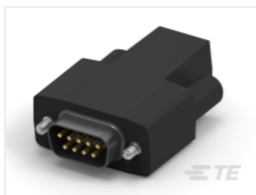
TE Part # 1-747944-5 09 SHLDG ENCL PLUG, LEAD FREE