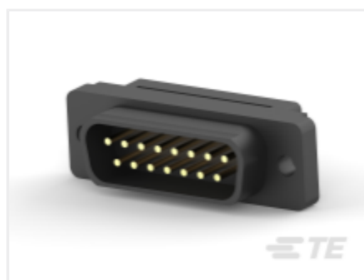
TE Part # CAT-AM7-H3 IDC D-Sub: Plug Assembly, Low Profile, Signal, 2.77 mm