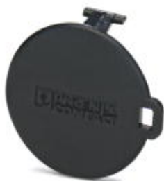
Protective cap for 3 and 5-pos. PRC field plugs

Please be informed that the data shown in this PDF Document is generated from our Online Catalog. Please find the complete data in the user's documentation. Our General Terms of Use for Downloads are valid ( http://phoenixcontact.com/download )