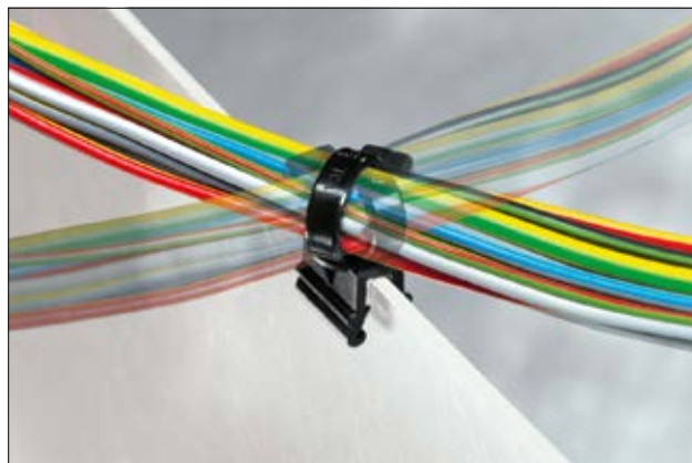
EdgeClip CBTO50R, rotatable 90°.