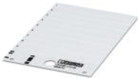
The illustration shows a version of the product

Snap-in markers, Card, silver, unlabeled, can be labeled with: THERMOMARK CARD, Mounting type: snapped into marker carrier, Lettering field: 52.5 x 15 mm