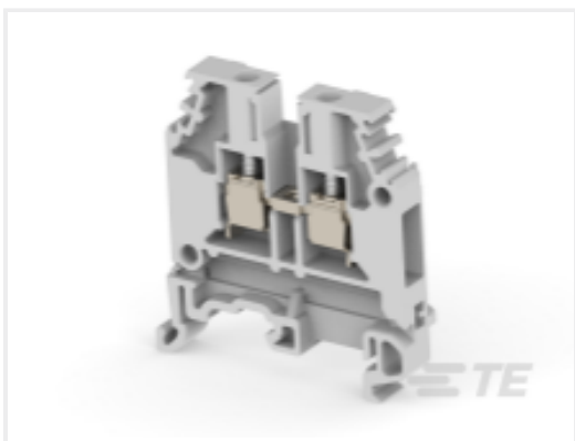
TE Part #1SNA115116R0700 M4/6