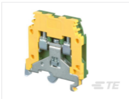
TE Part #1SNA165113R1600 M4/6.P