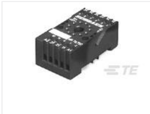
TE Part #1415035-1 MT78750