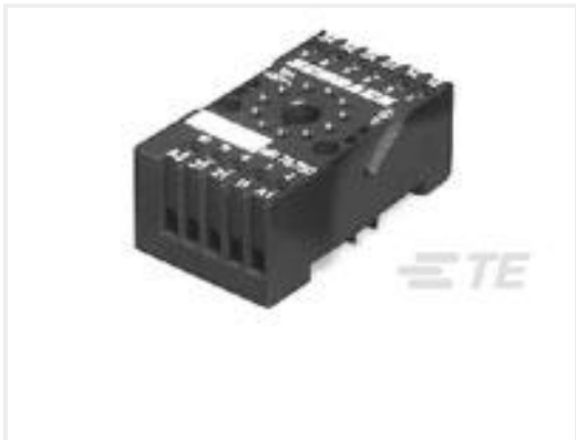
TE Part #3-1415035-1 MT78755