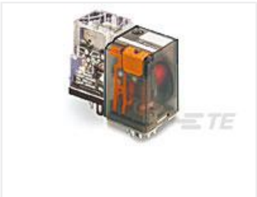
TE Part #9-1393091-7 MT326024