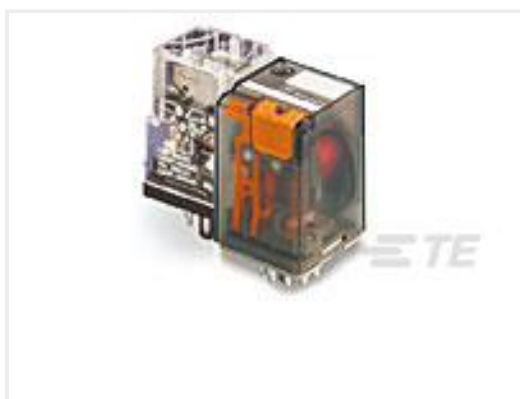
TE Part #8-1393091-4 MT323024