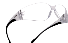
BANXSCI without cord

Coatings anti-scratch, anti-fog, anti-static (according to versions)