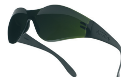
BANWPCC5 without cord