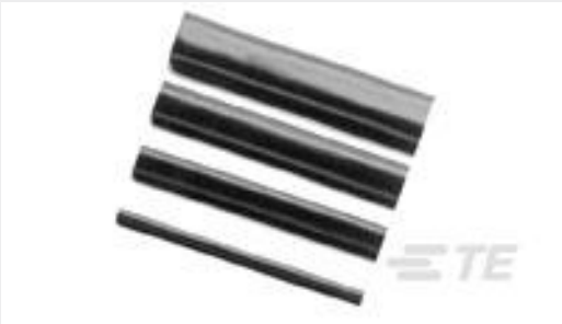
TE Part #CB5370-000 SST-48-15/FR/97