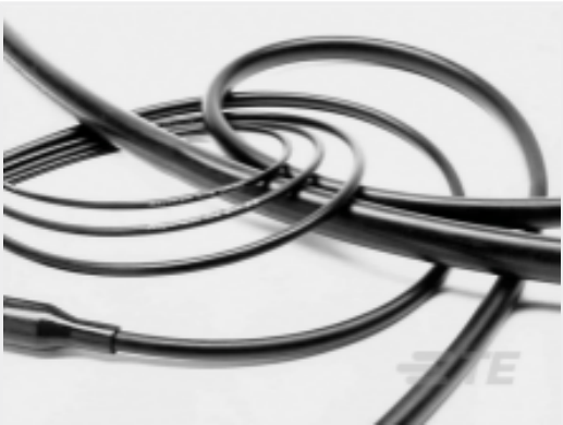
TE Part #CAT-R21-T79072 ZHTM: Heat Shrink Tubing, 2:1 Shrink Ratio