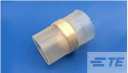
TE Part #696437-000 B-051-00-01