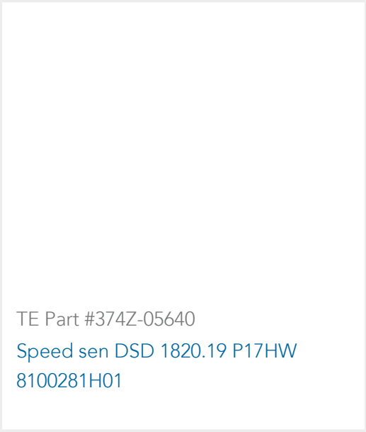
TE Part #374Z-05640 Speed sen DSD 1820.19 P17HW 8100281H01