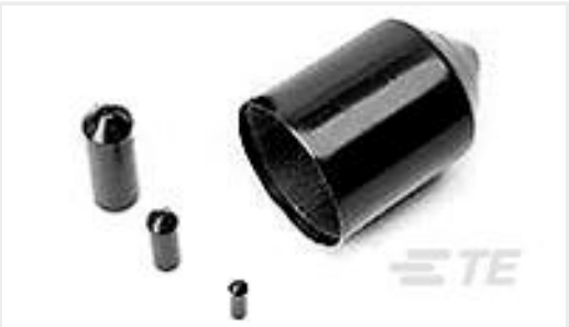
TE Part #439087-000 101A062-100-0