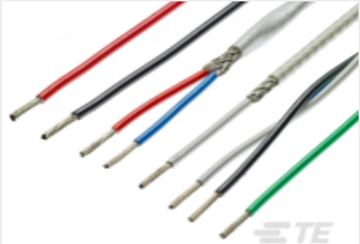
TE Part #D867783001 100G1121-0.40-6/9-0