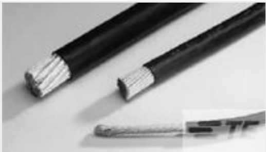
TE Part #6309833001 ZHI15-35-0