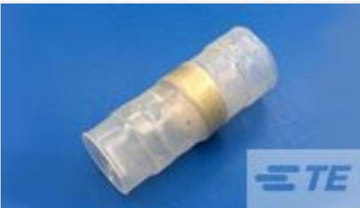
TE Part #696453-000 B-053-70