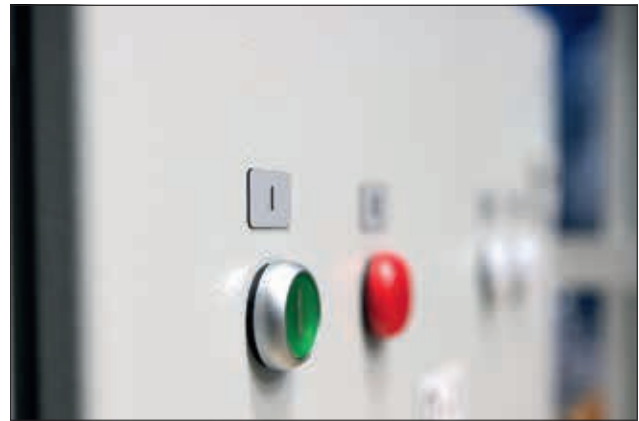
Panel labels are an ideal replacement for engraved plates.