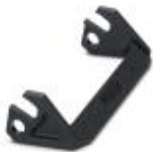
Replacement single locking latch for HEAVYCON EVO housing type B24, PA

Single locking latch - HC-B24-SL-PLBK - 1407701