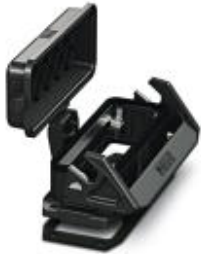
HEAVYCON EVO panel mounting base, plastic housing, B24, with single locking latch, height 30.5 mm, with flat gasket, with protective cover

Please be informed that the data shown in this PDF Document is generated from our Online Catalog. Please find the complete data in the user's documentation. Our General Terms of Use for Downloads are valid ( http://phoenixcontact.com/download )