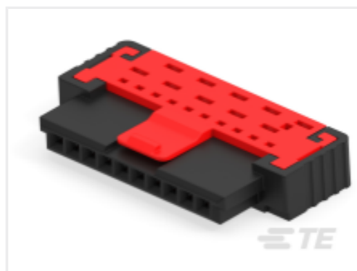
TE Part #234472-E SRCA 1,27 10 F 1 I2426 137 E1 094 1,07 T