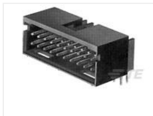
TE Part #5-102617-1 06 MODII HDR DRRA SHRD LF