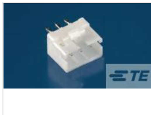
TE Part #1735446-3 2MM PITCH HPI POST HEADER, VERTICAL, 3P