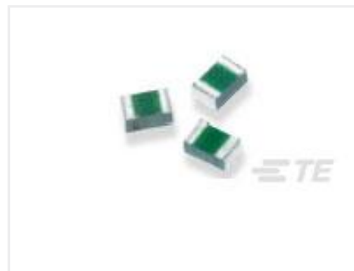
TE Part #1624365-1 NTC0805 5% 5K0