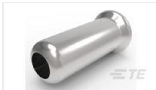
TE Part # 1-332070-3 SOCKET,MIN-SPR W/H AU SER-4