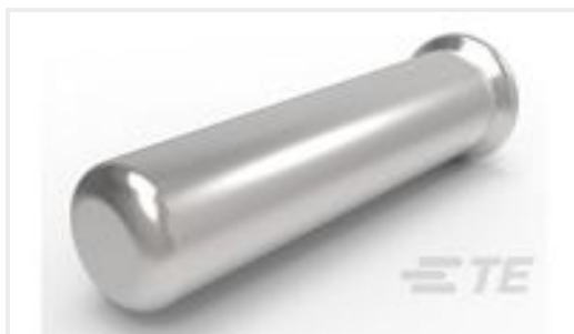
TE Part # 1-5331677-3 SOCKET,MIN-SPR SN SER-3U SER-3