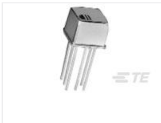
TE Part #1617146-4 JMGACD-12MW = M39016/18-040M