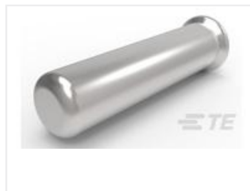
TE Part #2-330808-8 SOCKET,MIN-SPR AU SER-1