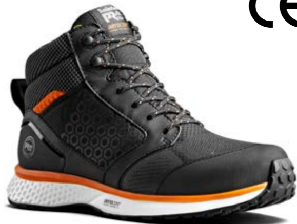
A263P 001 COMPOSITE SAFETY TOE Black/Orange