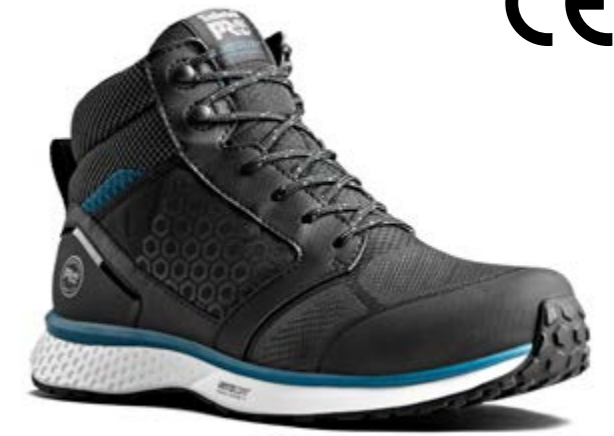
A2633 001 COMPOSITE SAFETY TOE Black/Blue