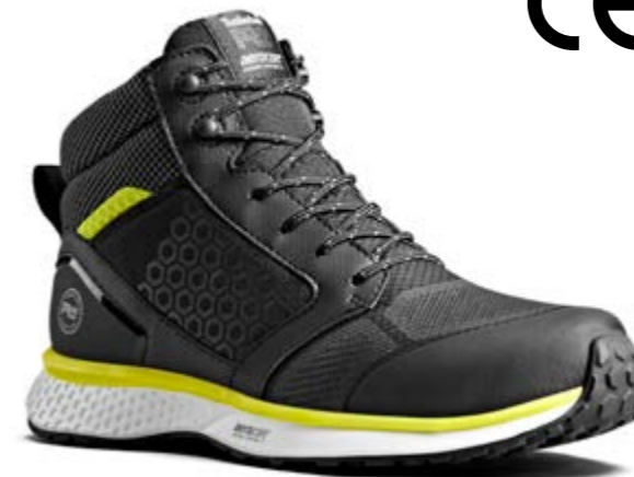
A25VS 001 COMPOSITE SAFETY TOE Black/Yellow